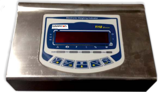
SS - Indicator