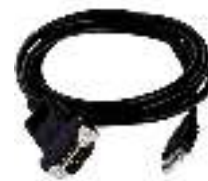
RS 232 USB cable